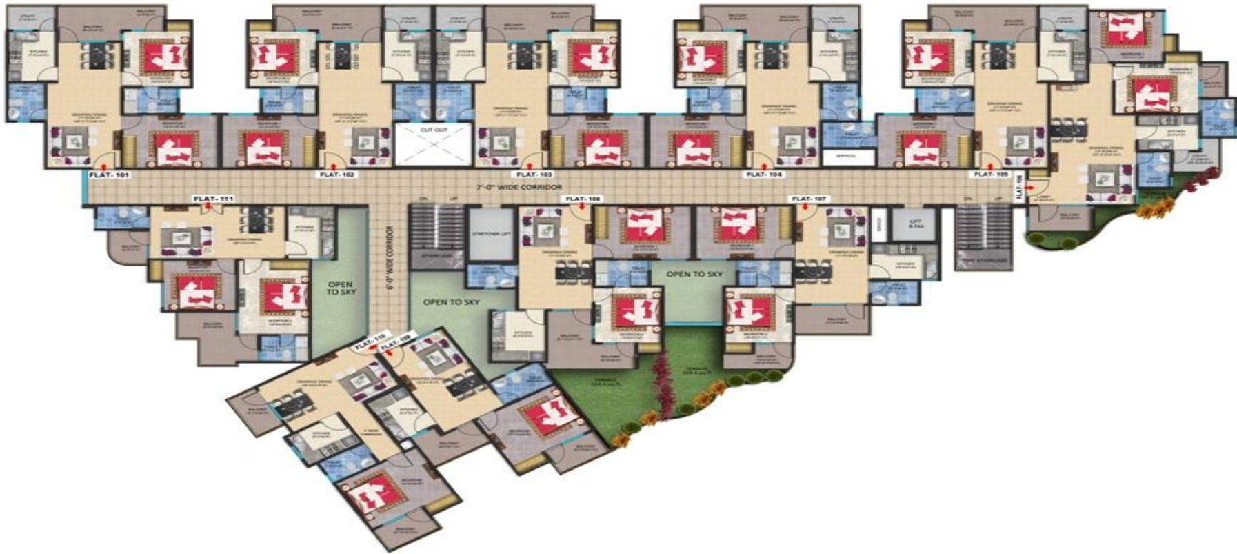
AVANA Typical Floor Plan